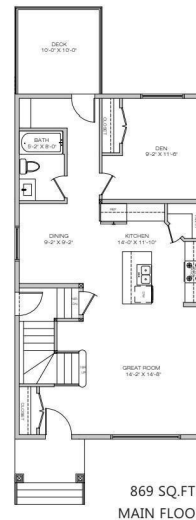
869 SQ.FT. MAIN FLOOR